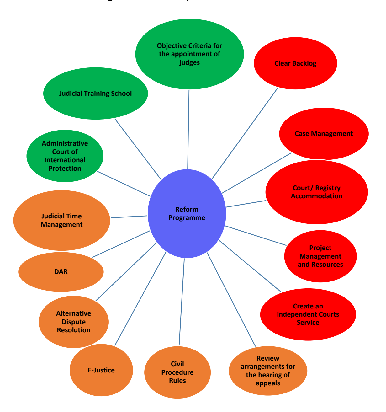
Figure 2: Reform Projects and Recommendations

There follows a description of the current status of each of the reform projects, followed in each case by an overall assessment.